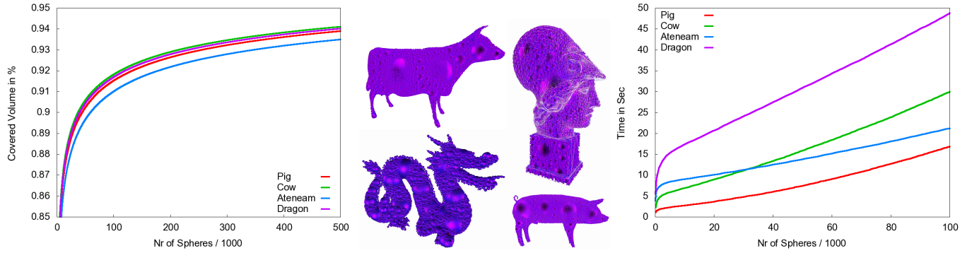
Figure 2: The space filling rate of our sphere packing algorithm (left). The models used for the timings: A cow, a pig, a bust and a dragon (middle). Timings for different objects on a Geforce GTX480 (right; please note that the code is not optimized yet).