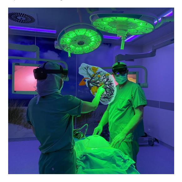
Figure 2: Surgeons using the Microsoft Hololens 2 to consult a 3D model of the patient's liver.

As the tool incorporates many real patient cases, it also presents valuable teaching opportunities as future surgeons can learn based on actual and up-to-date cases. Additionally, the 3D visualization provides an increased topographical understanding of the liver anatomy [17] and, therefore, can be used to teach residents or in anatomy lessons during medical school.