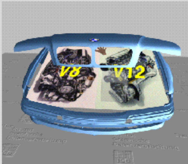
G. Zachmann, Color Plate I: The car hood is a rotational constrained object. It can be opened by pushing it up with the hand.